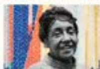
Marie Maynard Daly